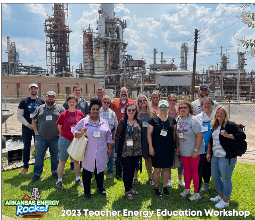
2023 Teacher Energy Education Workshop